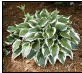
Hosta Patriot (Part sun/Shade)