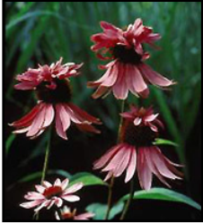
Echinacea Double Decker (Sun)