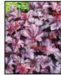
Heuchera Plum Pudding (Sun/Part Sun)