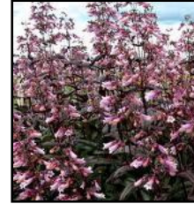
Penstemon Husker's Red (Sun/Part Sun)