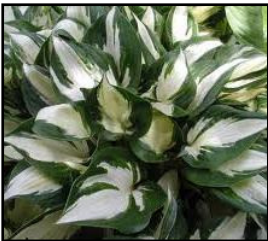
Hosta Fire & Ice (Part sun/Shade)