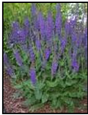
Salvia May Night (Sun)