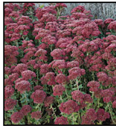
Sedum Autumn Fire (Sun)