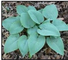
Hosta Fragrant Blue (Sun/Shade)