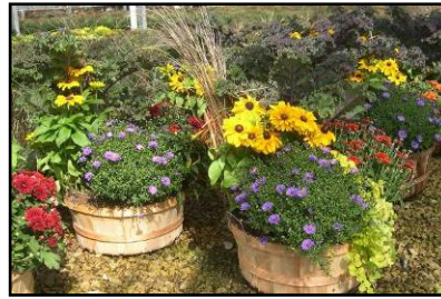
Fall Combination Basket

Fall Combination Basket picture is a representation only. We plant our combinations with the most beautiful plants available.