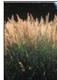
Calamagrostis Karl Foerster (Sun/Part Sun)