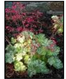
Heuchera Snow Angel (Sun/Part Sun)