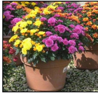
12" Pot (4 plants per pot)