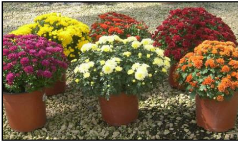
9" pot (2 plants per pot)