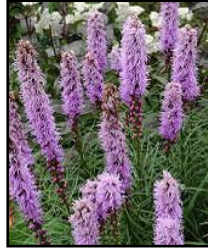
Liatris Kobold (Sun)