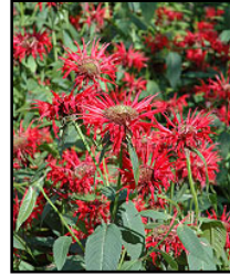
Monarda Raspberry Wine (Sun/Part Sun)