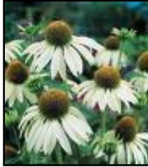
Echinacea White Swan (Sun)