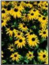
Rudbeckia (Sun/Part Sun)