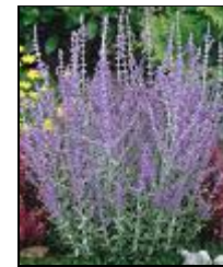
Russian Sage (Sun/Part Sun)