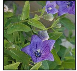
Platycodon Sentimental Blue (Sun)