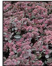
Sedum Vera Jameson (Sun)