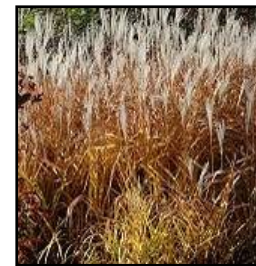
Miscanthus Flame Grass (Sun/Part Sun)