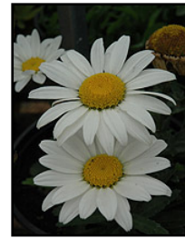
Shasta Daisy Snowcap (Sun/Part Sun)